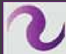
Bitmap or Raster Graphic Detail

If your print contains a photographic or raster based image make sure that the dimensions of the file are set to the actual size of the print and that your resolution is set to minimum of 75ppi. For example If you are using Adobe Photoshop and you select "Image Size" under the "Image" menu it should look like this if your sign is 22"x28" (see above image). If you are setting up your files at 1/2 or 1/4 the size of the intended output you will need to increase the image resolution to ensure image quality. All Raster images should be saved as either CMYK TIFF or CMYK EPS files.